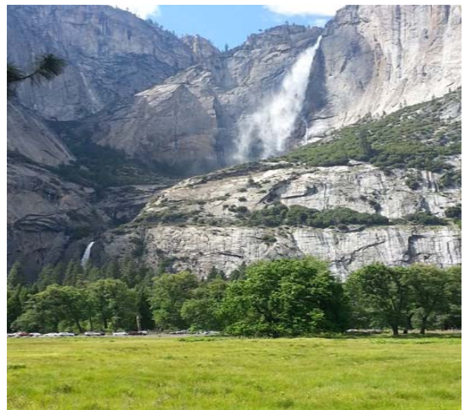
Yosemite Falls in Yosemite National Park